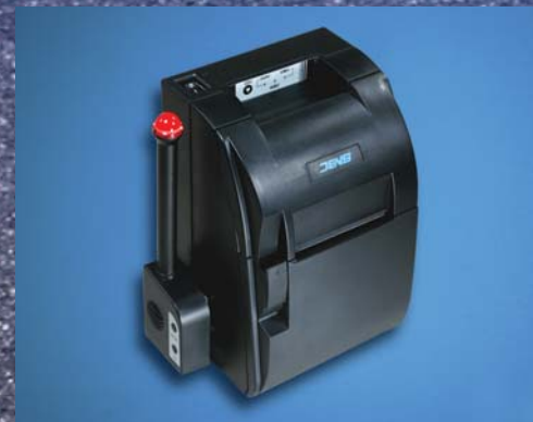
Built-In Wall Mount Bracket Optional Audio/Visual Print Messenger