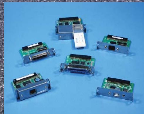
Easy to Change Interface Modules