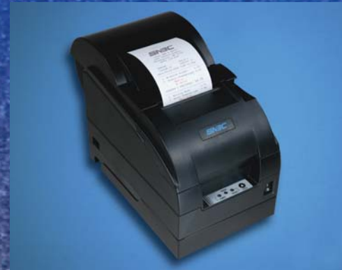
BTP-M280A Features Paper Take-Up Optional Power Supply Cover